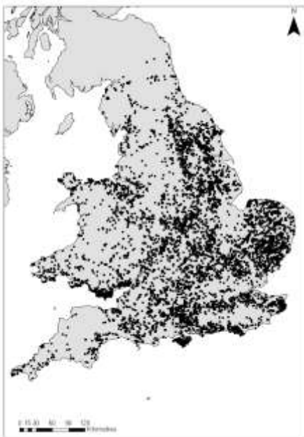
Fig. 2. The distribution of all coins recorded by the PAS between 1997 and 2011.

ularly in the fourth century AD where the PAS Mean exhibits higher per mill values than Reece's British Mean. This probably reflects the rural nature of the PAS dataset, as later coins are proportionally more common